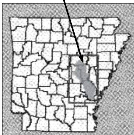
Arkansas's Grand Prairie

In Arkansas, early settlers found 320,000 acres of tallgrass prairie in the eastern region of the state, known as the Grand Prairie. Today only 430 acres remain.